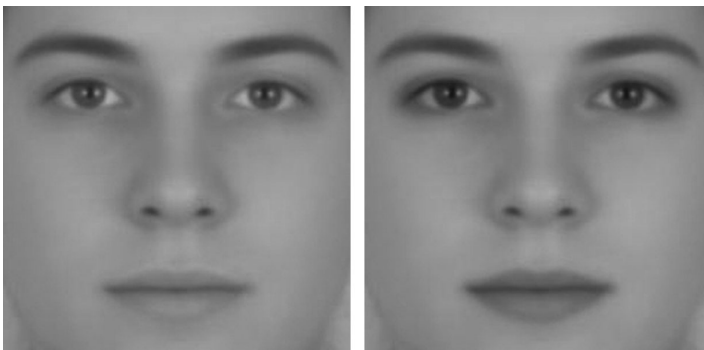
Figure 4. Variant of the Illusion of Sex. The face on the left appears male, while the face on the right appears female. Both images were produced by making slight alterations to the same original image. The eyes and lips were lightened to produce the left image, and darkened to produce the right image. The rest of the face was unaltered, and hence equally dark in both images. That decreasing or increasing facial contrast is sufficient to make a face appear male or female indicates that facial contrast plays a role in the perception of facial gender.

In the Illusion of Sex shown in figure 3, the face with lower contrast also has darker skin. Because males have darker skin, it is possible that the difference in skin darkness drives the illusion rather than the difference in facial contrast. To test this possibility, we can create a pair of faces in which facial contrast is manipulated by darkening or lightening the eyes and lips but keeping the rest of the face unchanged. These faces appear in figure 4. Again, the face on the left with decreased contrast appears male and the face on the right with increased contrast appears female. Because the two faces have the same skin tone, this provides evidence that facial contrast alone can be used as a cue for determining the sex of a face. Indeed, facial contrast may in fact be more important than overall lightness—darkening or lightening the entire face has no effect on perceived gender (see figure A2 in the appendix). Collectively, these versions of the