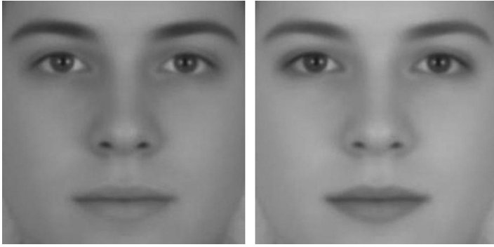
Figure 3. The Illusion of Sex. The face on the left appears male, while the face on the right appears female. Both images were produced by making slight alterations to the same original image. The eyes and lips were unaltered, and hence equally dark in both images. The remainder of the image was darkened to produce the left image, and lightened to produce the right image. The eyes and lips may appear darker in the right image than in the left image, but are not—it is an example of simultaneous contrast.

the eyes and lips were left unchanged, but the rest of the image was darkened to produce the left image or lightened to produce the right image. Because the eyes and lips were unchanged while the rest of the face was made darker or lighter, facial contrast was decreased or increased. Though a subtle manipulation, it has a powerful effect—making the image on the left with decreased contrast appear male and the image on the right with increased contrast appear female.