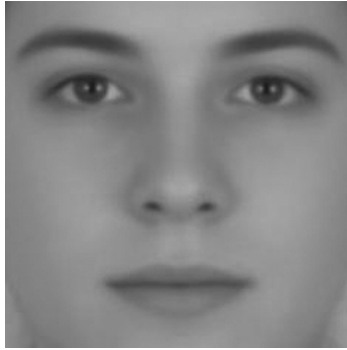
Figure A1. This androgynous face was produced by morphing together Caucasian male and female averaged faces. It was manipulated to produce the faces in figures 3, 4, and A2.