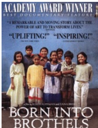
Born into Brothels (Film)

*all books and films available in Musselman Library