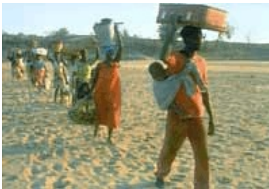
The Tree of Our Forefathers (film)

*all books and films available in Musselman Library