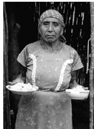
The Long Road Home (film)