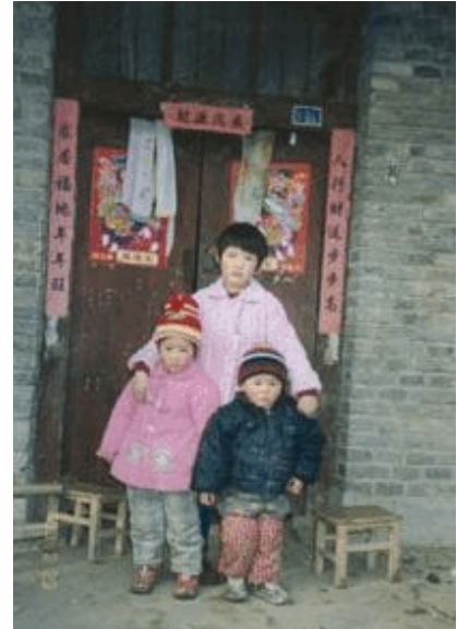
To Live is Better than to Die

Assignments: Paper #4: on Koff book (Friday) Darfur Forum contribution –by Wednesday class-time