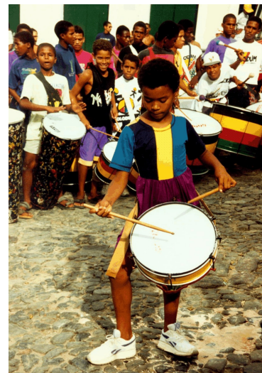
Odô Yá! (Film)