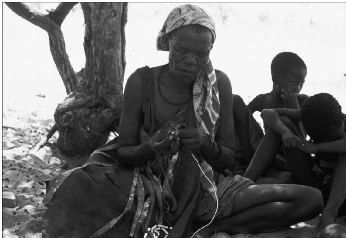
Fig. 6. Khwe woman polishing pieces of ostrich egg shell when she lived at Molapo, Central Kalahari Game Reserve (CKGR), Botswana. Molapo residents were forcibly removed from the CKGR in 2002. Along with others who were relocated, 72 Molapo residents have taken the Botswana government to court. Last month 51 Khwe returned to Molapo.