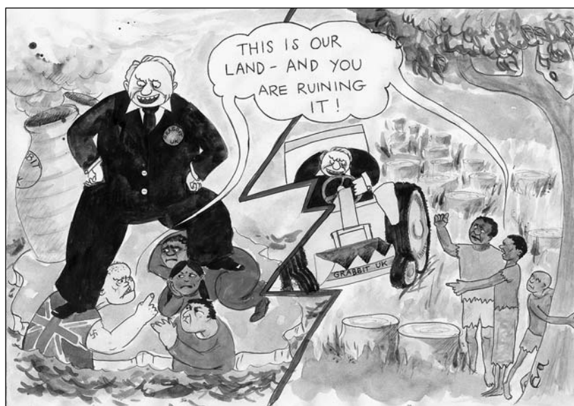
Fig. 7. Eva Schonveld's cartoon points out the fallacy of equating indigenous people's claims for land rights with right-wing nationalism among dominant populations.

(Povinelli 1998) while anthropologists argue over categories – it is superficially easy to argue that indigenous peoples are not really different from other citizens, and that if they pretend they are it is simply to take advantage of the system to privilege themselves over others (Kuper 2003).