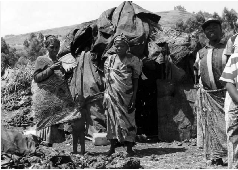
Fig. 3. Twa evicted from Mgahinga National Park squatting in huts made from plastic bags on wasteland in Kisoro town, south-western Uganda, 2002.

indigenous peoples' collective rights are being recognized in international law (Colchester 2002), although the strongest resistance to this move has come from settler societies such as Canada, Australia and America, and from their political allies such as the current UK government (Asch & Sampson 2003).