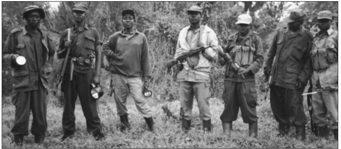
Fig. 4. Wildlife wardens and Ugandan military personnel financed by tourist revenue in south-western Uganda are central to enforcing the appropriation of Twa forest lands and to preventing Twa from carrying out forest-based subsistence practices.