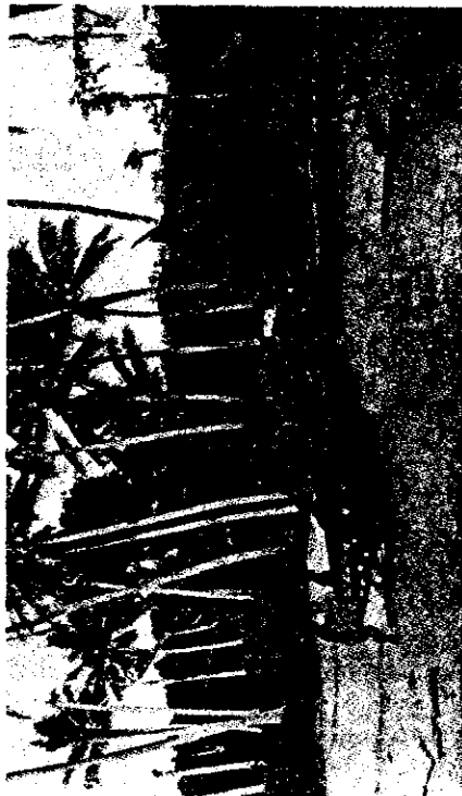
PUTTING A CANOE INTO ITS HANGAR

Nigada Bu'a, the sea-going canoe of Omarakana, showing general form, ornamentation of prowboards, the leaf-shaped paddles and the form of the out-rigger log. (See p. 106, also next Chapter.)