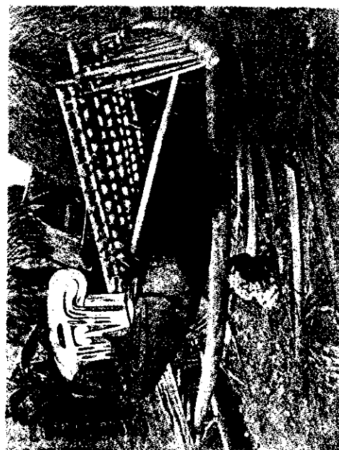
FISHING CANOE (KALIPOULO)

Above the profile of a canoe, shows the outline of the dug-out, the relative width of the gunwale planks and the hull, and the general shape of the canoe. The bottom picture shows the attachment of the outrigger to the hull, the prow, the prow-boards and the platform. (See p. 106.)