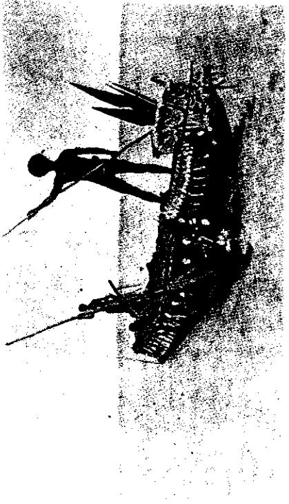
A MASAWA CANOE

Nigada Bu'a, the sea-going canoe of Omarakana, showing general form, ornamentation of prowboards, the leaf-shaped paddles and the form of the out-rigger log. (See p. 106, also next Chapter.)