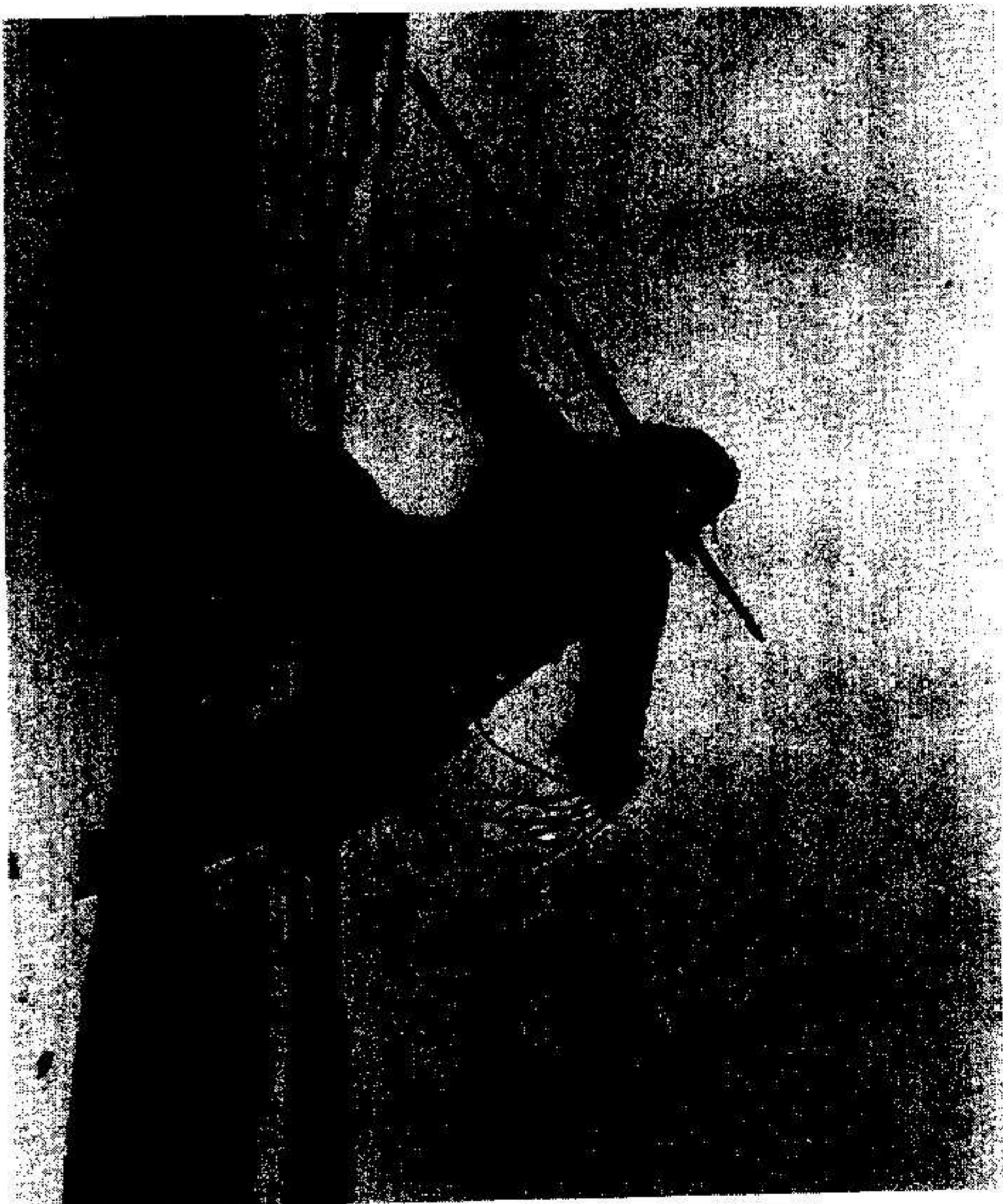
26. Still from Nanook of the North (1922), dir. Robert Flaherty.

The cinema of Flaherty worked in the same way: Nanook and his family were represented in a cinematic "ethnographic present" in which intertitles establish the camera, and thus the filmmaker, as observer. Furthermore, if the indigenous man, Nanook, is constructed as a being without artifice, as referent, the indigenous woman is there to be uncovered, her body—and this is true of ethnographic cinema in general—to be scopically possessed by the camera/filmmaker and the audience as well. As intended, however, this form of ethnographic film, infused with the notion of death and the idea of vanishing races, is a cinema of archetypal moments endlessly repeated. 14 In