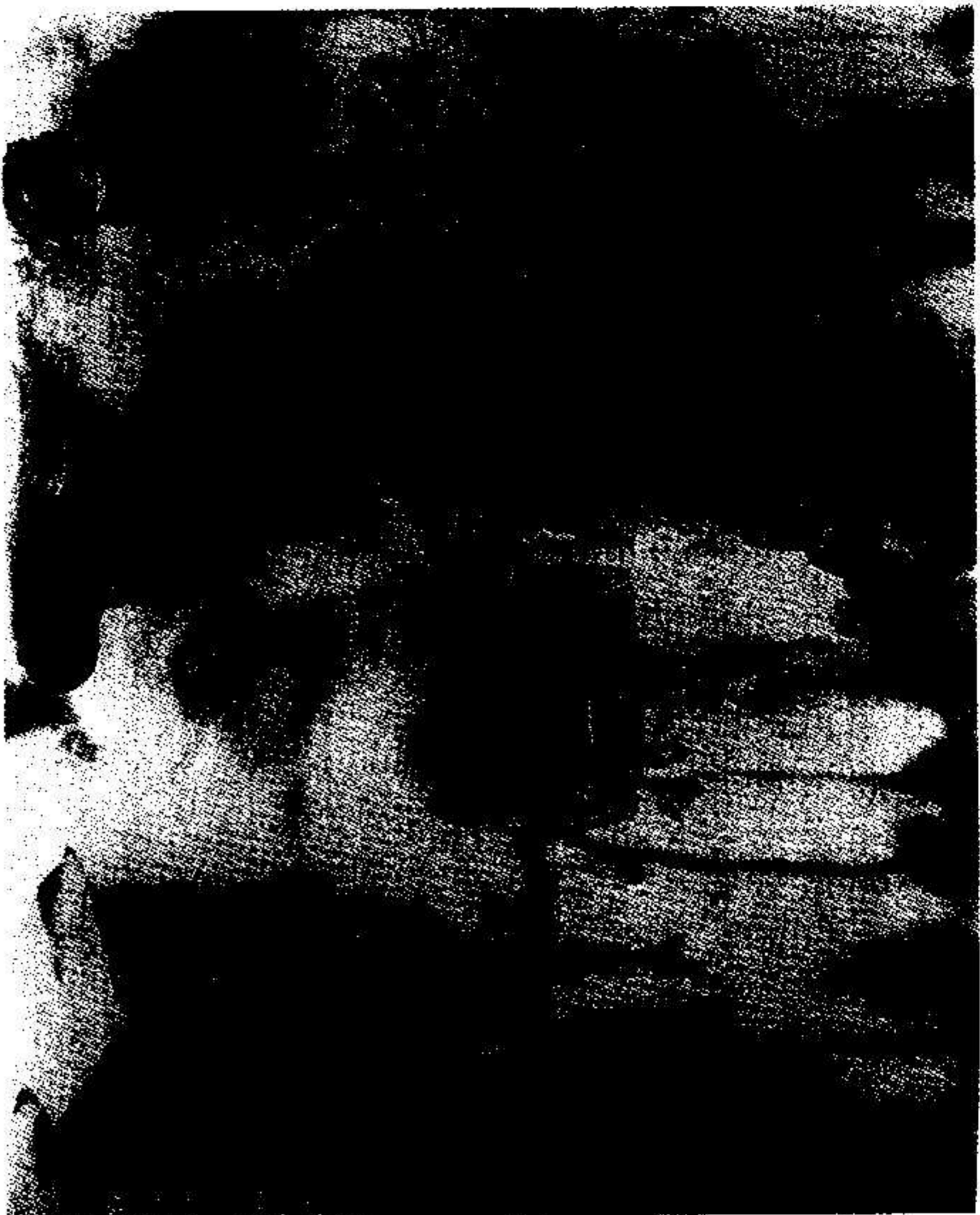
28. Still from Nanook of the North (1922), dir. Robert Flaherty.

Like a museum display in which sculpted models of family groups perform "traditional activities," Nanook's family adopts a variety of poses for the camera. These scenes of the picturesque always represent a particular view of family or community, usually with the father as hunter and the mother as nurturer, paralleling Western views of the nuclear family.